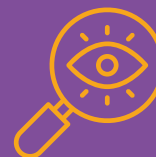
User-defined search set generation