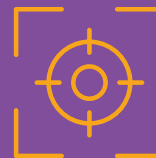
Single point of entry